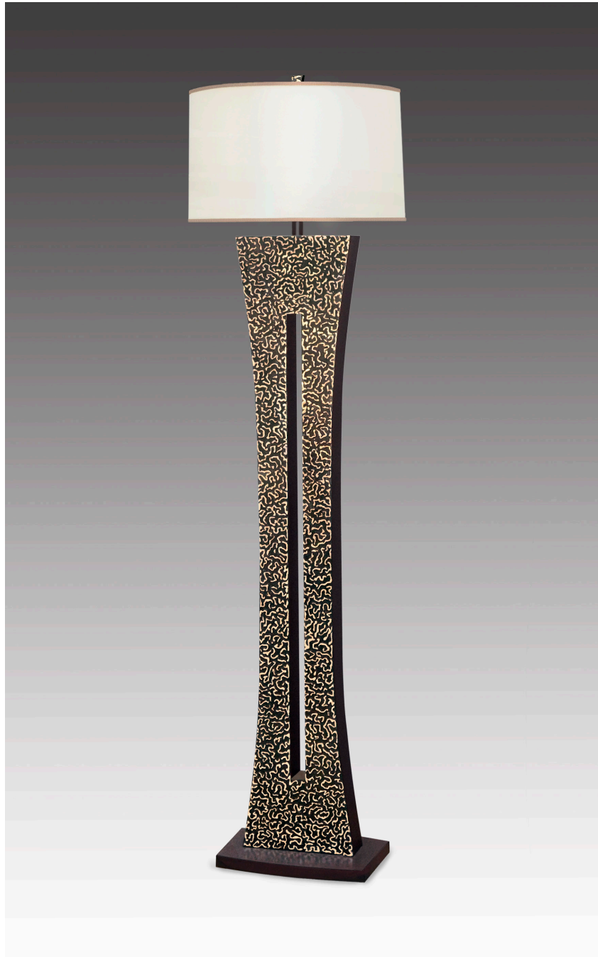
Fast Curve Floor Lamp Polished Bronze Stipple