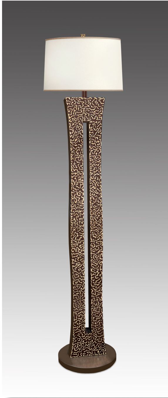
Slow Curve Floor Lamp Polished Bronze Stipple