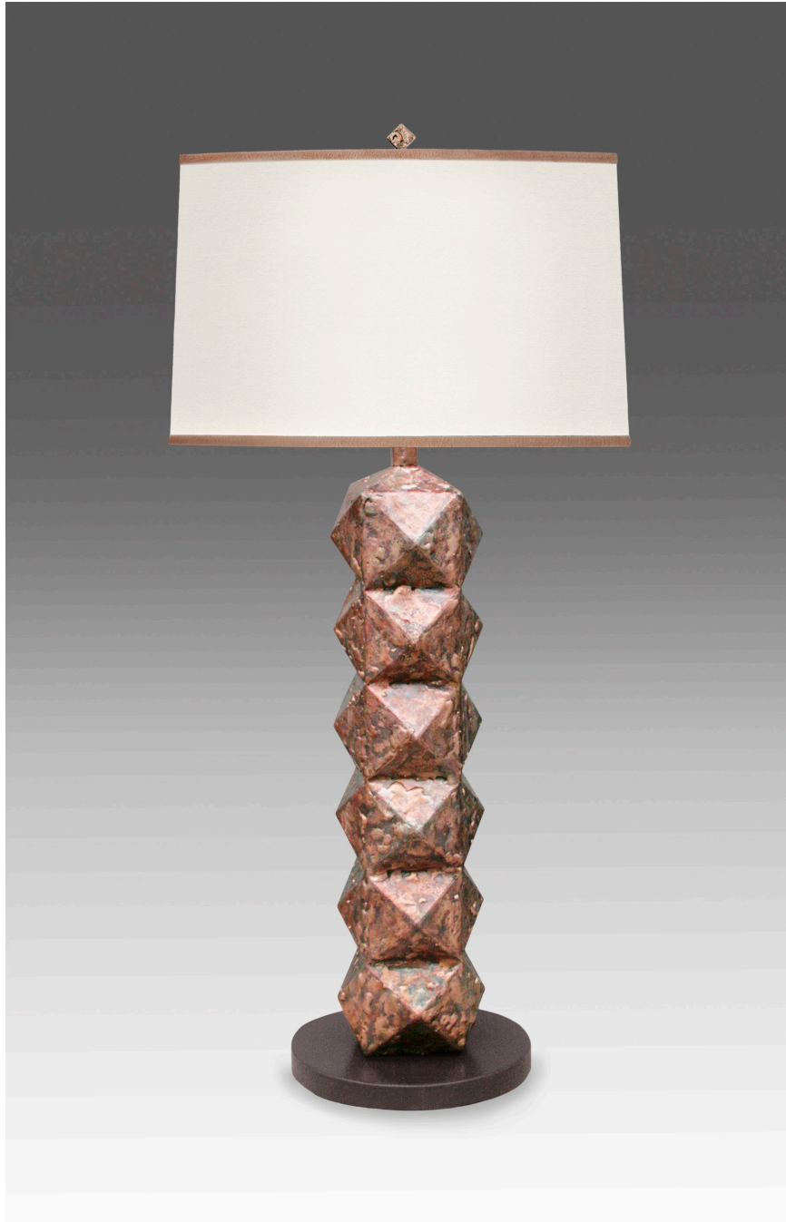
Quadra 1C Table Lamp Full Bronze Flame Patina