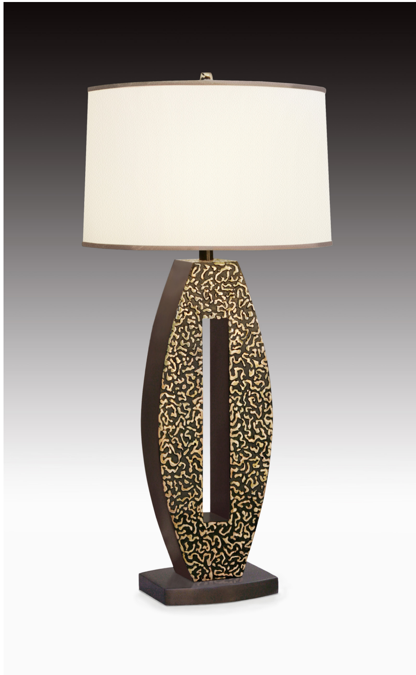
Needle Table Lamp Polished Bronze Stipple