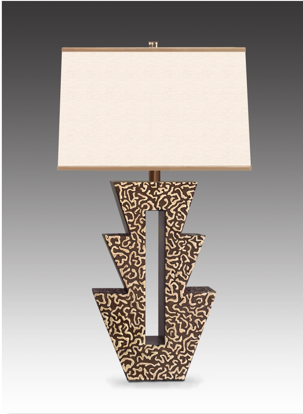
Step Table Lamp Polished Bronze Stipple