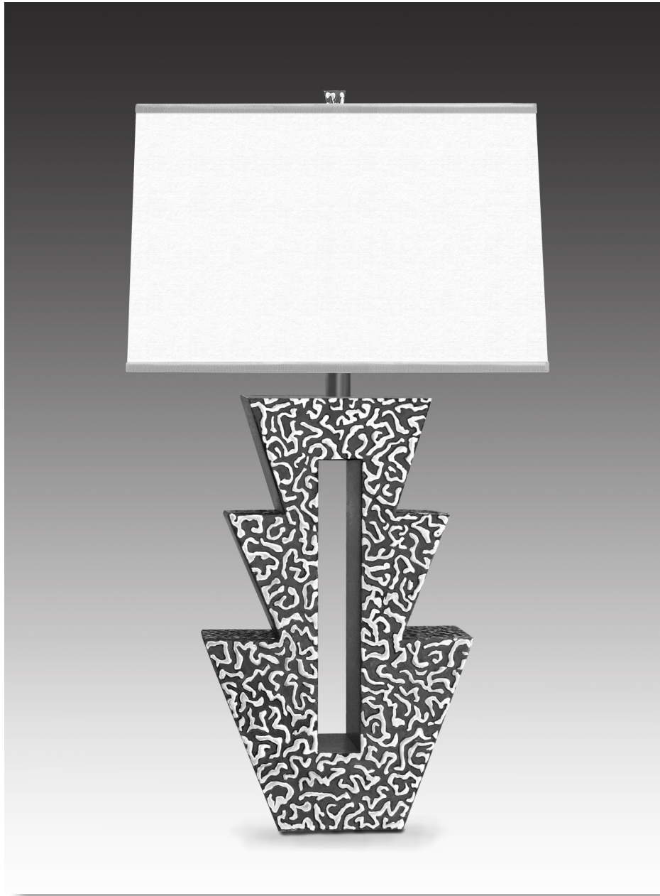
Step Table Lamp Polished Steel Stipple