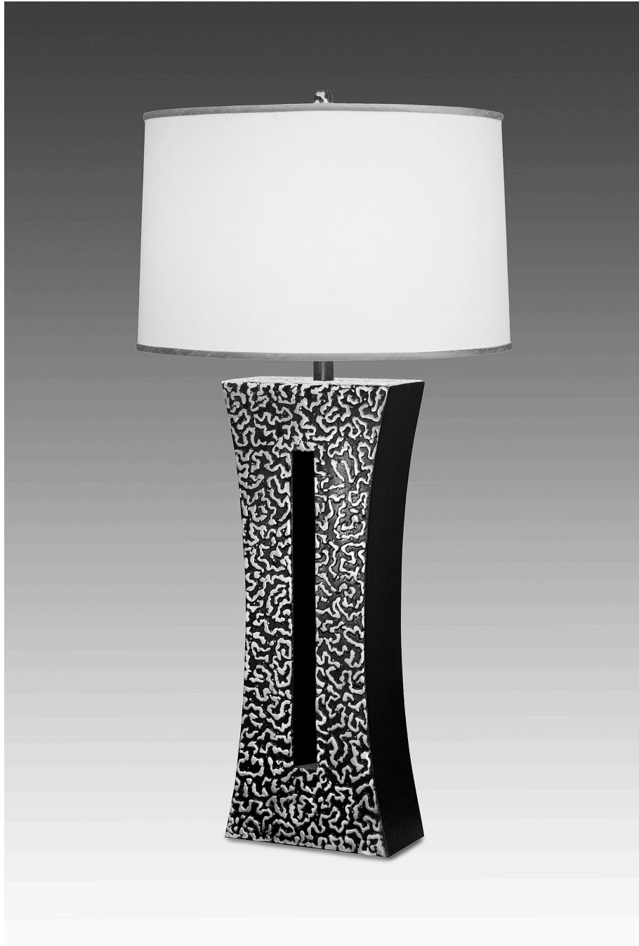
Fast Curve Table Lamp Polished Steel Stipple