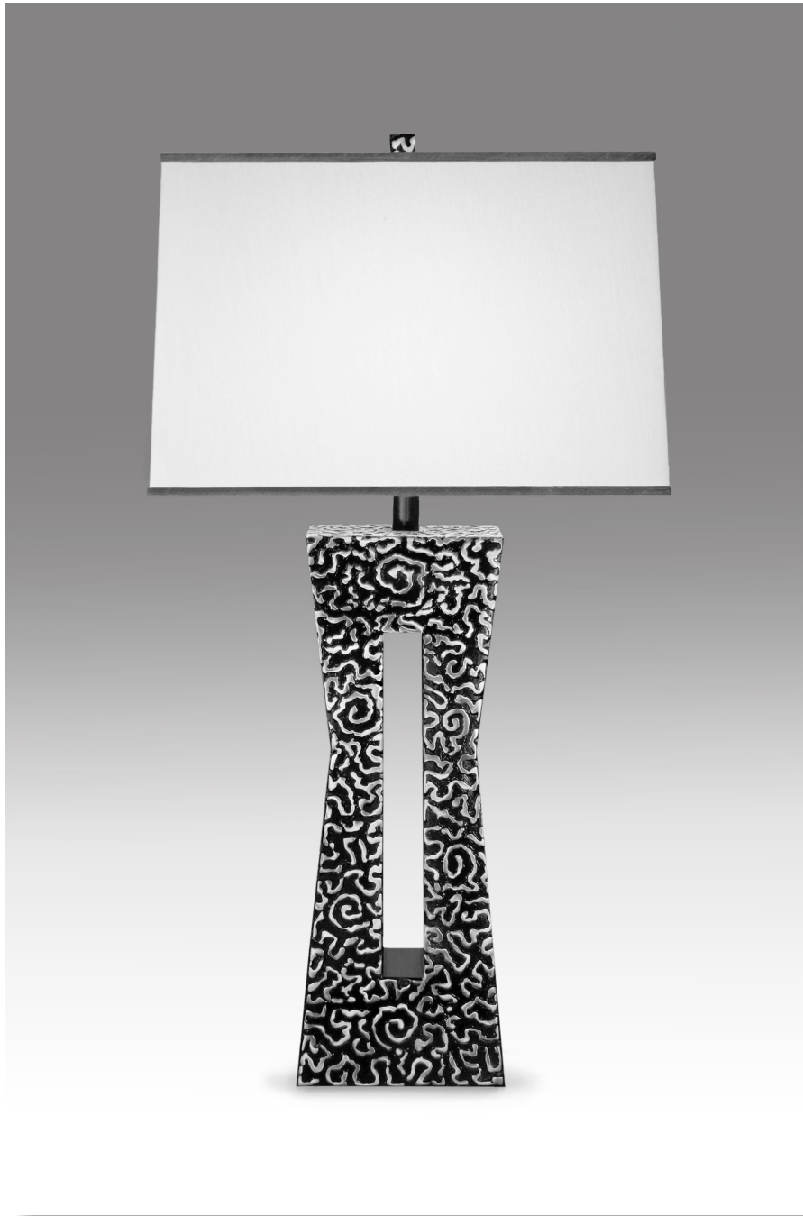
KeyHole Table Lamp Polished Steel Stipple