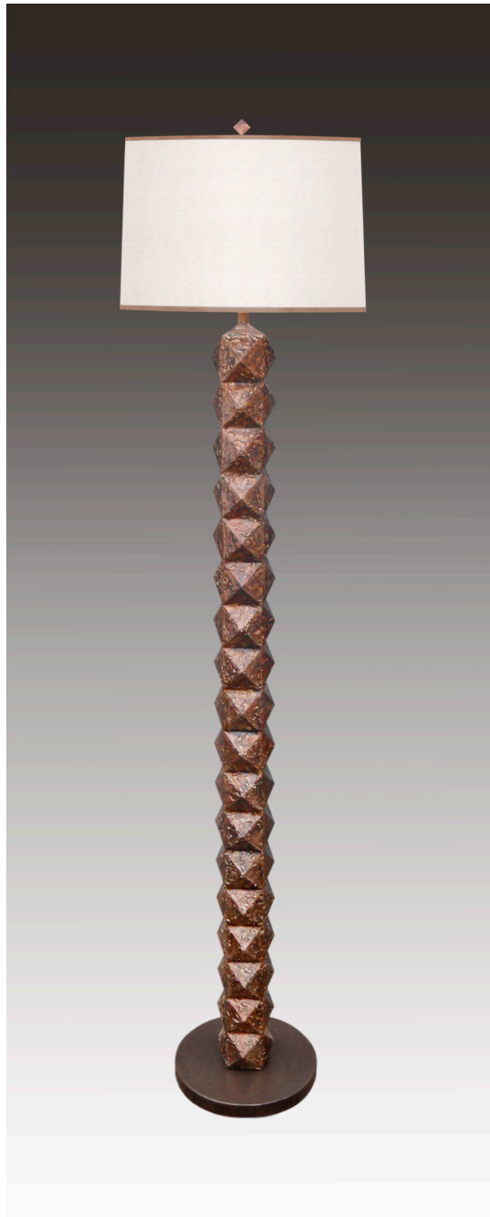
Quadra 1C Floor Lamp Full Bronze Flame Patina